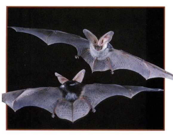
These spotted bats are flying in opposite directions.

Bats are the only mammals that can fly. Bats fly to find food and to find safe roosts , or shelters. They also fly to escape predators . Predators are animals that hunt and eat other animals. Bats can travel long distances by flying high in the sky, where the wind helps carry them along.