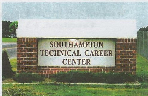
Southampton Technical Career Center 23450 Southampton Parkway Courtland, Virginia 23837