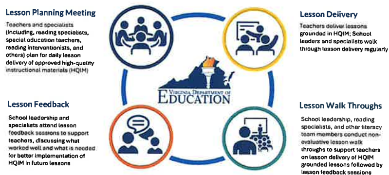
Figure 3 from VDOE VLA Implementation Playbook, p 37