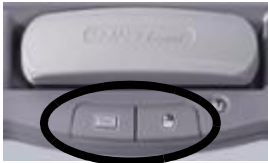
Pen tray buttons